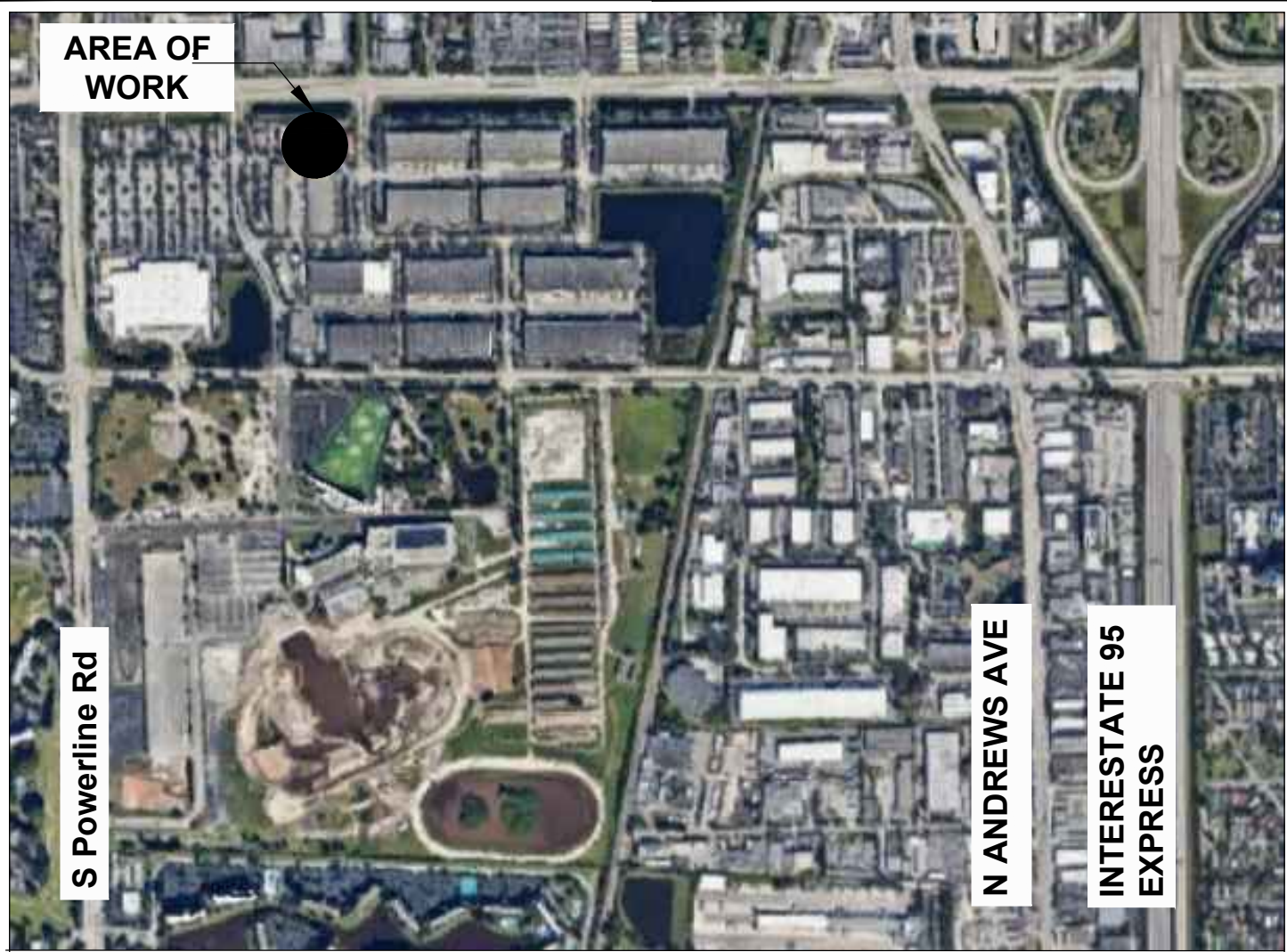
VICINITY MAP SCALE: INSERT FIELD