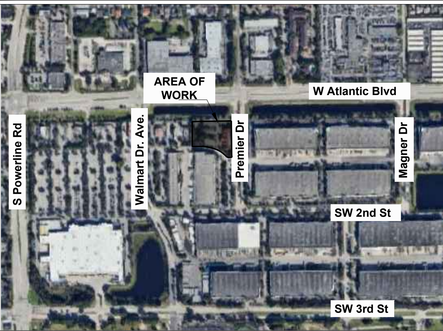
LOCATION MAP SCALE: INSERT FIELD

OWNER / DEVELOPER COMPANY: RED LINK MANAGEMENT CORP. CONTACT: EDGAR HALAC ADDRESS: 2750 NE 185TH STREET #304 AVENTURA, FL 33180 EMAIL: edgarhalac@gmail.com PHONE: 305 610 5141